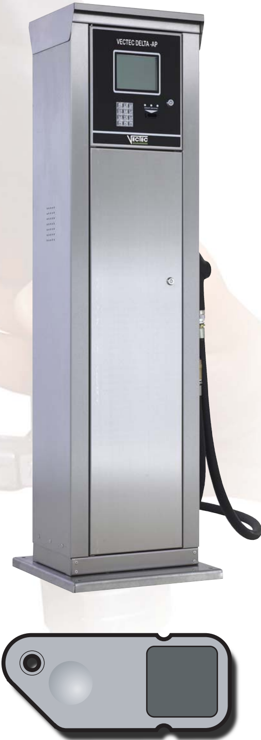
DATATAG - Shown life size designed to fit on a standard keyring.

Datatag is Robust,Reliable and Easy to use